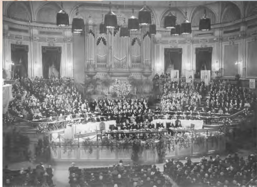
WCC Amsterdam 1948

D espite this heritage, the SCM under Tatlow's leadership gradually moved away from its evangelical roots. From its inception, SCM had included students from the Scottish Free Church who were heavily influenced by rationalistic German theology and higher criticism. As the movement expanded, it recruited new constituencies and broadened its doctrinal