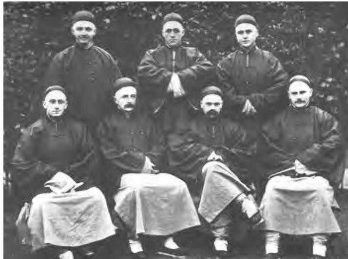
The Cambridge Seven

Known as the “Cambridge Seven” these were men of wealth and intellectual and athletic distinction. Studd, who gave away his fortune, had played cricket for England against Australia in the Test match that gave rise to the “Ashes” tradition. In the years to follow, scores of other students from Cambridge and across Britain followed their example.